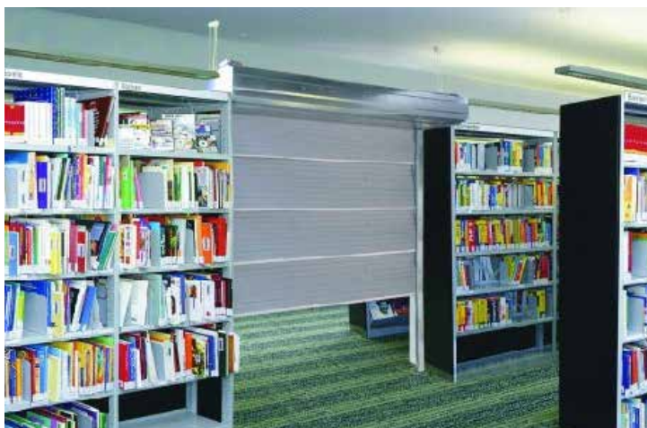
Fibershield –/120/120 can be used as an operable wall to protect combustible assets.

The control box is a compact system providing battery back up as standard. The controller requires a standard 240V, 10A power supply and an alarm signal in the form of a normally closed dry contact. A localised smoke or heat detector may also be used to activate the system. Please contact our technical department for details on 1300 665 471.