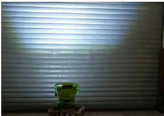
Fibershield -/120/120 unique barrier provides full insulation equivalent to a fire resistant wall when fully deployed

The Fibershield -/120/120 provides full fire integrity and insulation for 120 minutes without the need for sprinklers.